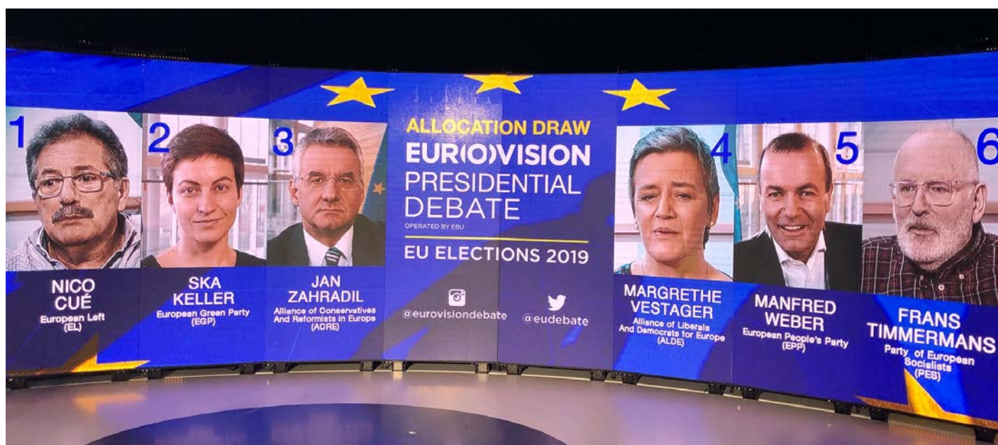
Lead candidates of the six European political parties due to participate in the Eurovision debate, to be held in Parliament's Brussels hemicycle, on 15 May 2019.

This is a revised and further updated edition of an earlier briefing; previous edition from February 2019.